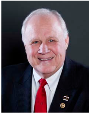
Message from the Mayor Chair of the Police Board

As Chair of the Police Board, I have the privilege of working with my fellow board members to oversee the growth and progress of the New Westminster Police Department, ensuring top levels of service to our community in every aspect of the department. When I see the hard work and dedication sworn members and civilian staff put into their work, I can confidently say that New Westminster is in good hands.